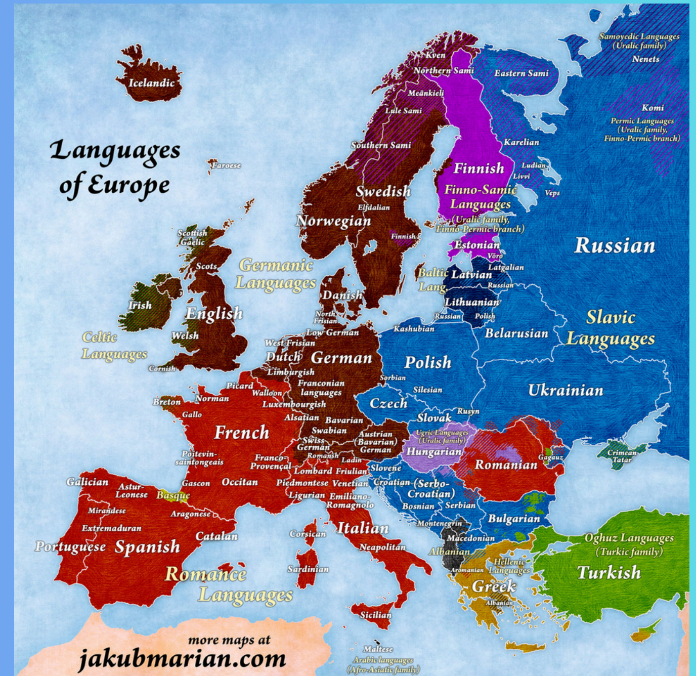
(Map of European languages and sub-languages inscribed in English)

(Dialects, sub-languages, and distinct languages are marked as such.)